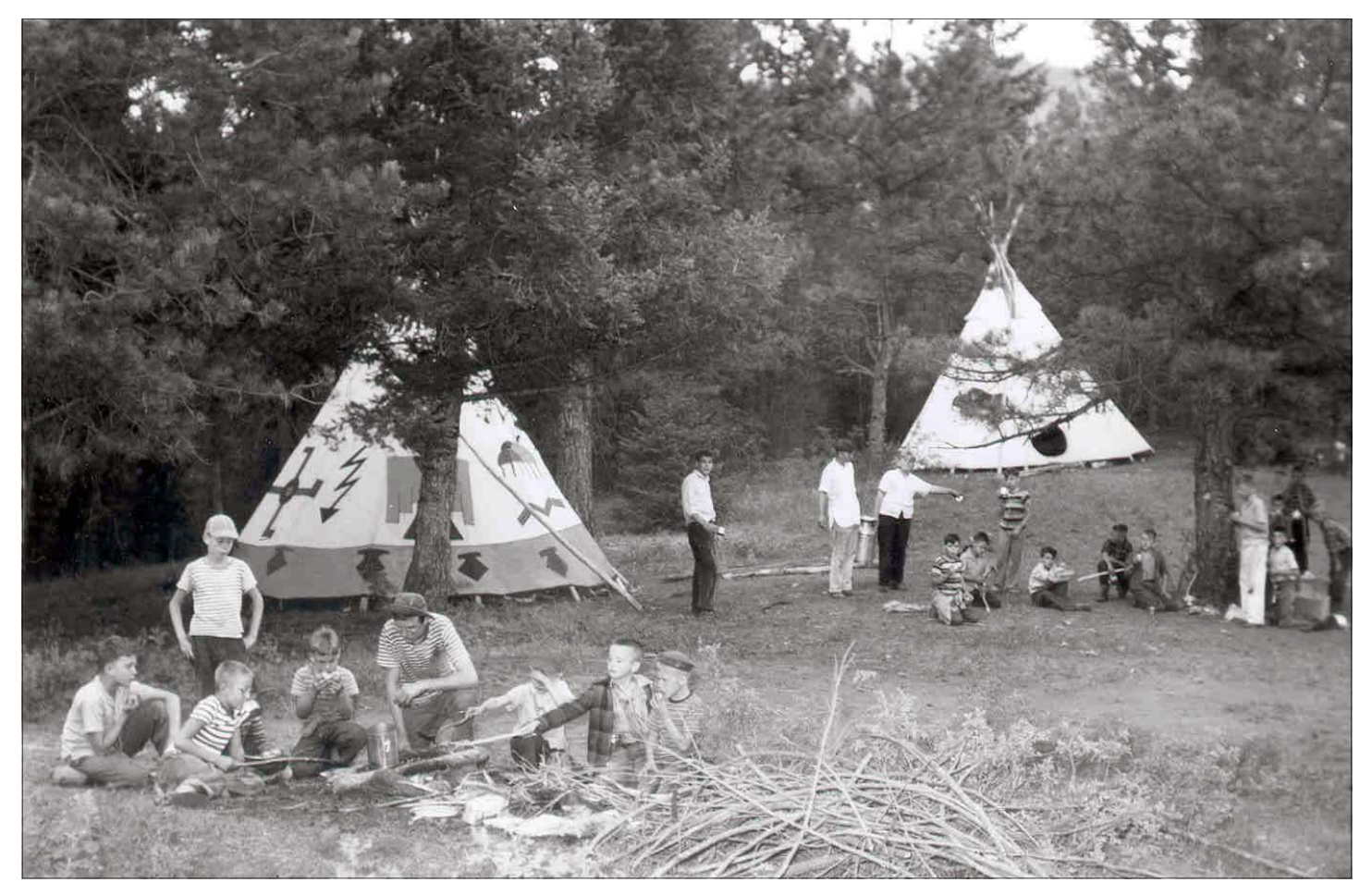
Circa 1957. Teepee camping "back in the day!" Where was this flat spot?